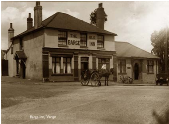
The Barge Inn, Vange.