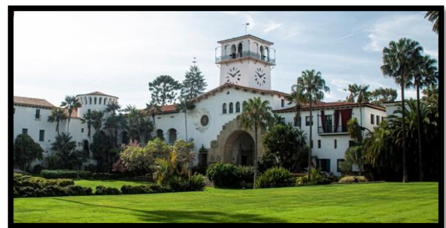
Santa Barbara – Court House

We continue to work with our friends in California, generally meeting by Zoom on a weekly basis both as group meetings and with individuals, helping with research into their family and social histories. Also, by sending copies of the various topic booklets and the borough community booklets of Basildon as well as copies of the lectures we have given here which also prove of great interest to them.