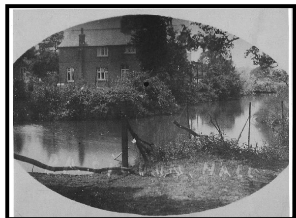
Basildon Hall pre-1914

Today, this site is registered as a Historical Scheduled Monument, reminding us of our rich heritage...Join us in unearthing and celebrating the vibrant history of Basildon”.