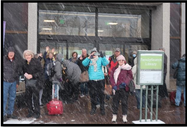
Ventura group waiting in the rain for their Family Library to open.