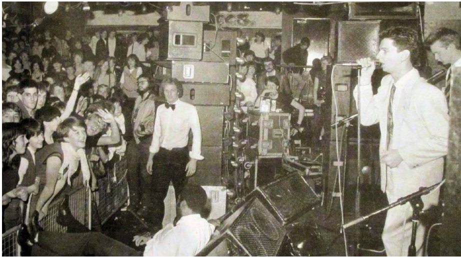
Depecho Mode – Racquels

It was then during the 1980s that Basildon's biggest act to date, Depeche Mode appeared at Raquels.