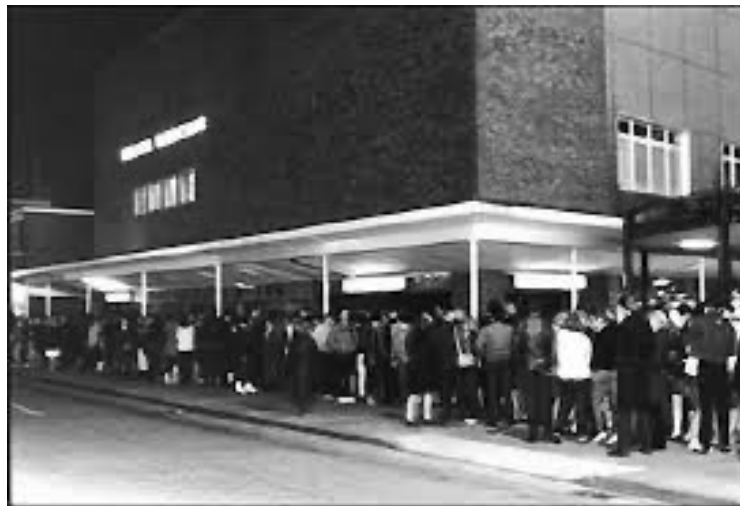
The Mecca - Basildon

Building work on the four-storey building was soon underway and by 1959 the first phase of Blenheim House, as it became officially known, was completed. The new shopping block of four units were subsequently numbered 1-4 South Walk and the function hall was given a Market Pavement address, number 23. The remainder of the South Walk shops in Phase II were then completed during 1960 and began trading around December of the same year.