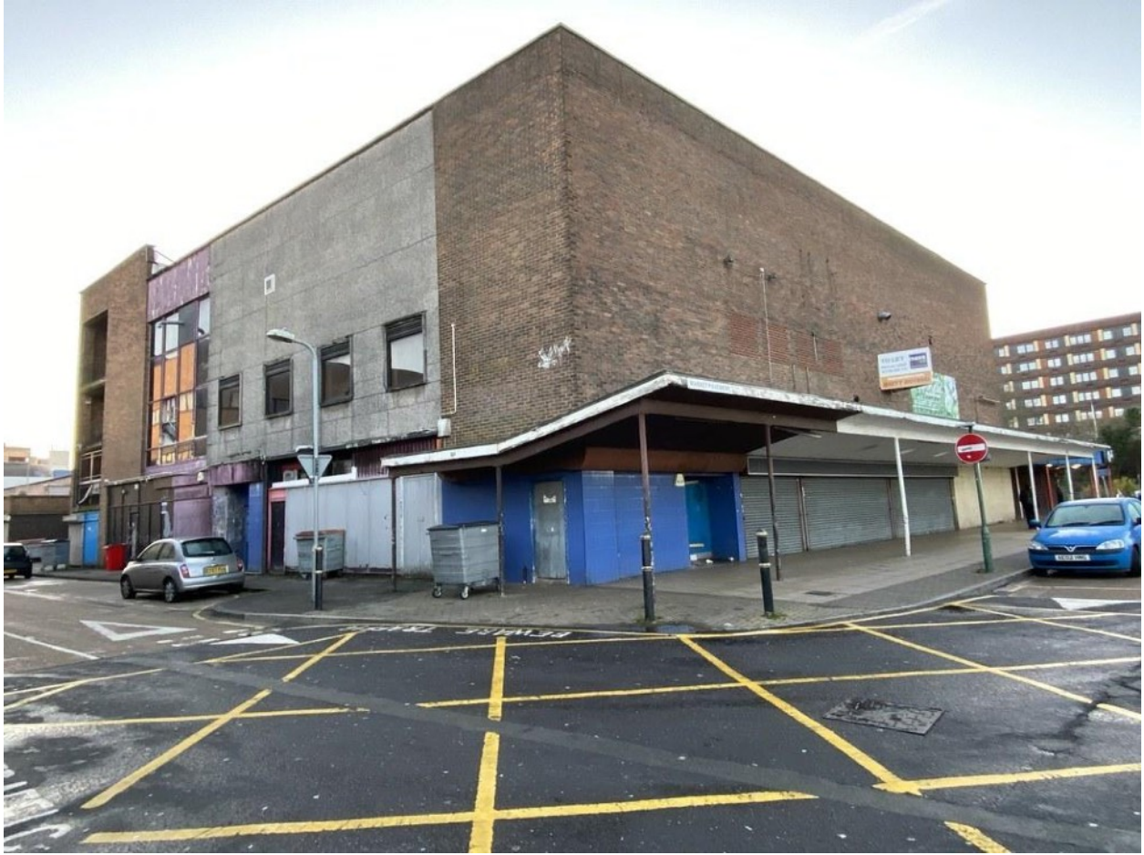
The Ex-Night-Club today February 2024

KFP Basildon Borough Heritage Society (BBHS) 23 rd Feb 2024