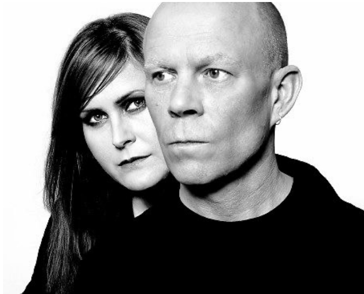
Alison Moyet and Vince Clarke

An annexe to the dance floor known as Strings was provided with a Piano Bar and was opened in December 1985. The area was capable of holding around 250 people and featured a small stage on which stood a white grand piano. It closed in 1994 and was replaced by an American themed 'Buzz' Bar.