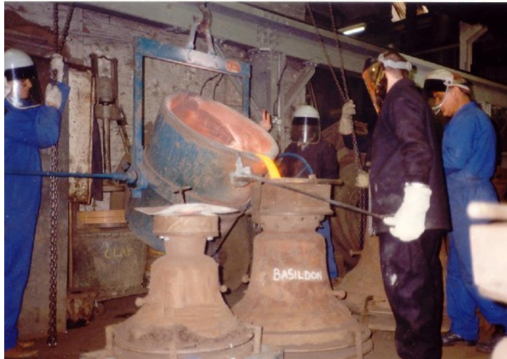
Casting of the Treble Bell at Whitechapel Foundry 6 February 1997