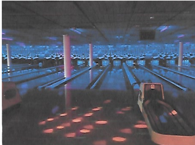
Basildon Bowl – High Payment

In September 2015 after four years of being boarded up the alley's management announced that the centre has closed due mainly to a historic dispute over rent. The area has since been converted to apartments.