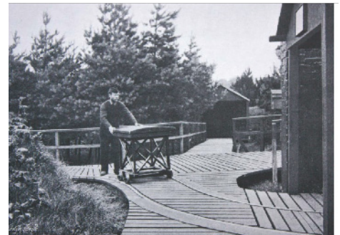
Works overalls had no pockets. They were different colours according to your job so you could only access areas you knew enough about to work safely in. If there was an accident the colours helped the head count to see quickly who was missing in which area.

But despite the danger, many people worked at the factory, including women, who stepped in to help during the war when many men went to fight.