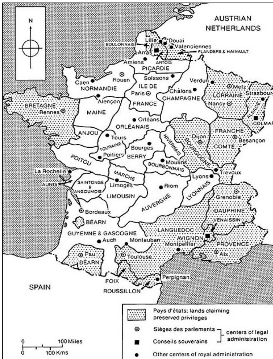
Figure 2 The French provinces, 1789. Photo: John Paxton, Companion to the French Revolution, Facts on File, New York and Oxford, 1988. Reproduced by permission of John Paxton.

There were 83 new administrative units created in January 1790 by decree of the Assembly, most of which exist to this day. They were subdivided into districts, and these in turn into cantons and communes (or municipalities).