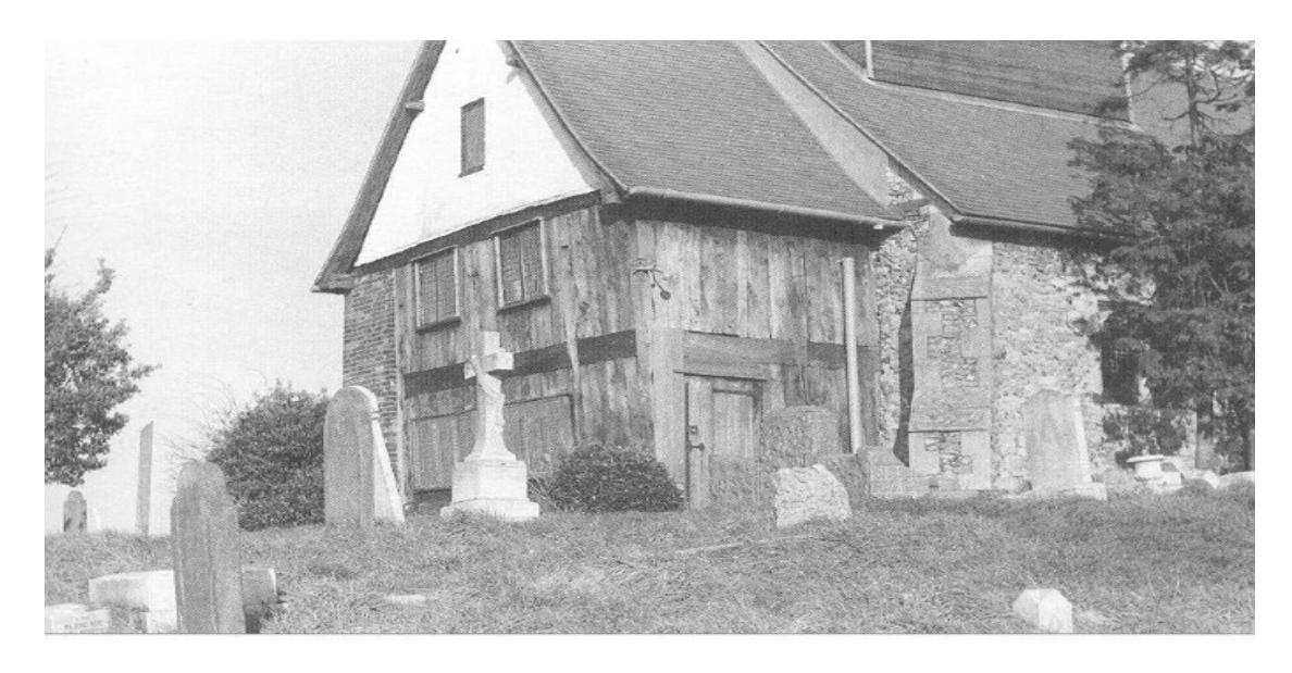
Priest/School House at St Nicholas Church, Laindon

Just over two hundred years ago, I believe one of Basildon's most remarkable individuals was born, although today not many local people seem to know of him.