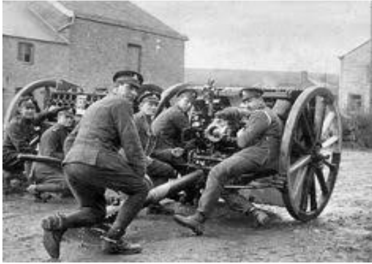
212 th Siege Battery Royal Garrison Artillery