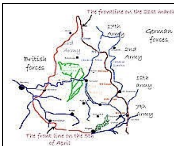
The front line between British and German forces, 21 March – 5 April 1918

The Germans chose to attack the sector around St. Quentin taken over by the British from February–April 1917, following the German withdrawal to the Hindenburg Line. Germany had begun construction of the Siegfried Stellung (Hindenburg Line) in September 1916, during the battle of the Somme. It stretched over 500 km (300 mi) from the Channel to the Moselle River and was built by Belgian and Russian prisoners of war. The strongest section was the salient at St. Quentin between Arras and Soissons. The line was 1.5 km (1 mi) deep with barbed wire in zig-zag lines of 15 m (50 ft), protecting three lines of trenches, interconnecting tunnels and strong points. In the rear were deep underground bunkers known as stollen (galleries) and artillery was hidden on reverse slopes. The Germans withdrew to this line in an operation codenamed Alberich over five weeks, during which time German High Command ordered a scorched earth policy. The ground abandoned in the retreat was laid waste, wells were poisoned, booby-traps laid and most towns and villages were destroyed.