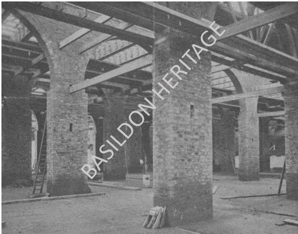
Vange Reservoir under construction 1912